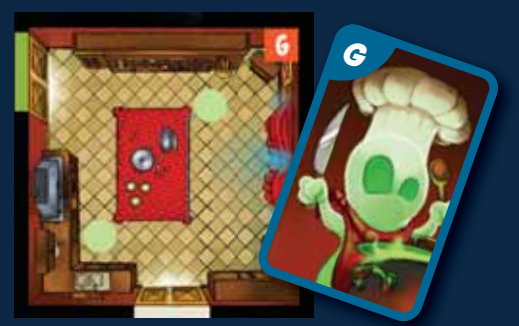
B - Matching Letters